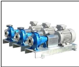
316SS Centrifugal Pumpsets