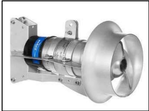
Bespoke mixer arrangement

In addition to the typical examples on our website www.southernpumping.com.au we have pictures following of: -