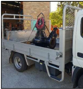
Submersible pump repair for delivery to site