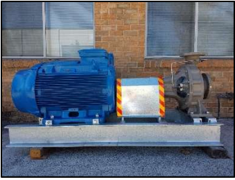
110kW pumpset built