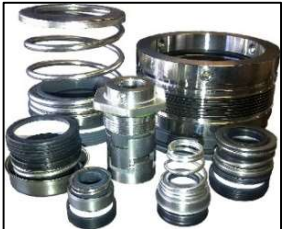
Over 10000 mech seals in stock