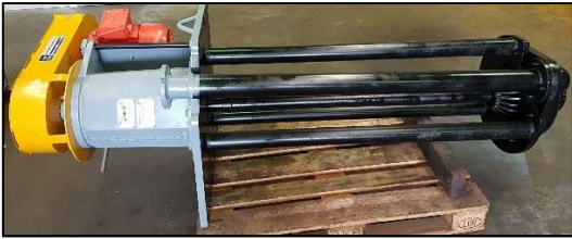
Rebuilt cantilevered sump pump