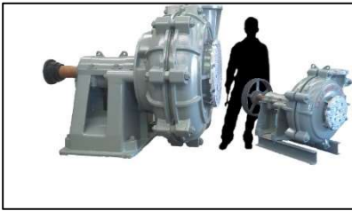
Rubber lined slurry pumps overhauled