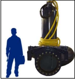
Interstage pump repaired for Cronulla STP