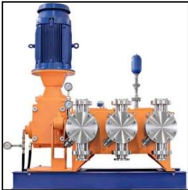
Triplex dosing pump